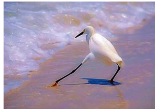
The Water's Lovely!

If you'd like to put a toe in the water and have not yet done so, we will be creating extra space at our All Age Services for you to enjoy live worship again.