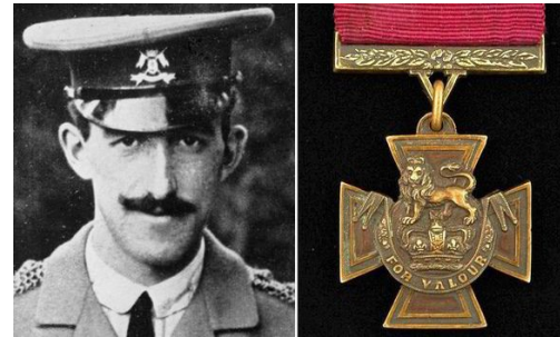
Captain Francis Grenfell VC 9th Lancers: Western Front 1915