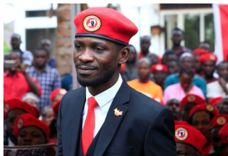
Bobi Wine—popstar and politician

Peace in Uganda is now very fragile. The January elections could lead to many more deaths.