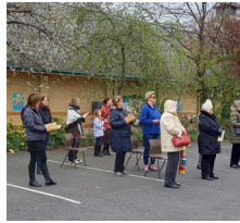
Just a few of the many people who worshipped on Good Friday

This picture gives you an idea of the social distancing. However, there were a lot of us spread from one end of the car park to the other with the musicians in the middle. We asked those coming to the service to park in Morrissons or the Haydon Centre.