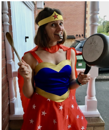
It's Wonder Woman! She not only sings! She provides her own melody Instrument and percussion!