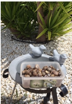
Linda Simpson's huge collection of snails taken from the walls of her home in Spain in a single day, all about to go back to the wild.