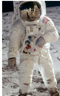
One small step for a vicar ...