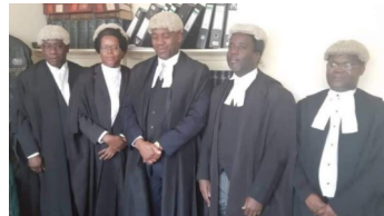
People of courage

Remarkably, the country's top judges took the unusual and courageous step of cancelling the fraudulent elections. New elections will be held this year, with the aim of ensuring that the people of Malawi get to exercise their democratic right to choose their president fairly.