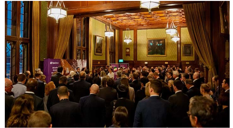
MPS learning more about persecuted Christians