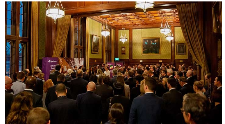
MPS learning more about persecuted Christians