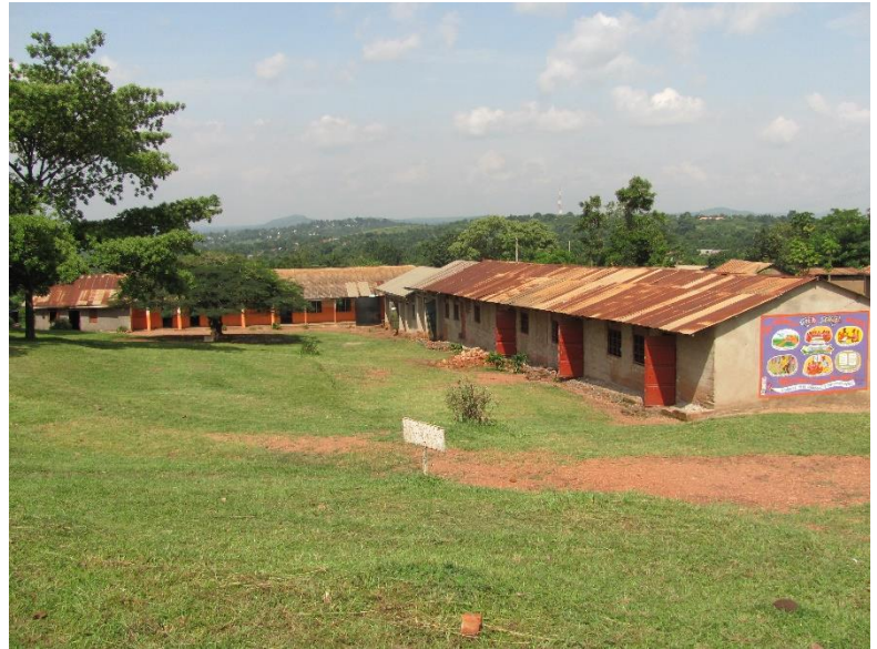
Katikamu Sebamala Primary School

If your church or a local school would be interested in forming a specific link with a named school or project in Luweero or Kampala diocese please contact Sally